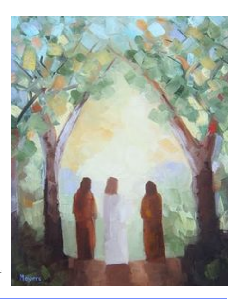
Image: https://i.pinimg.com/236x/2f/40/3e/2f403efd3502b4852a3e42a165b8c 9fb--emmaus-walk-emmaus-road.jpg